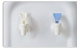
Cook & Cold water faucet