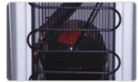
Hermetically sealed reciprocating Compressor