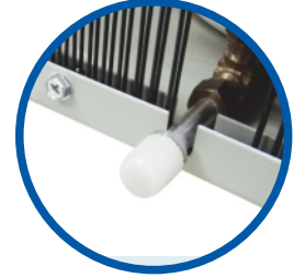
Cold tank drain