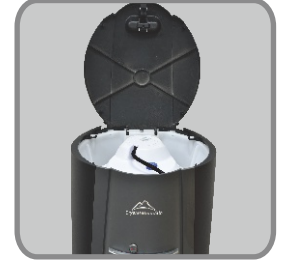
Retrofitted to Become a Point of Use Dispenser