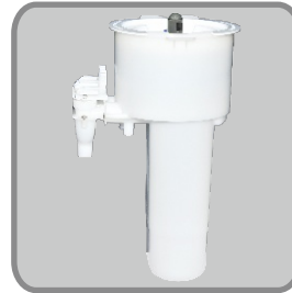
Removable Reservoir/Faucet Assembly (patent pending)