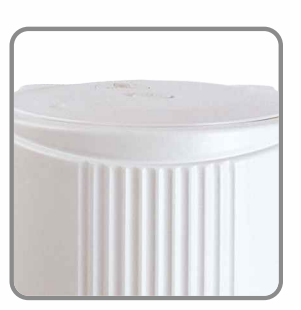
Point Of Use System