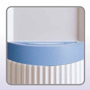
Removable drip tray