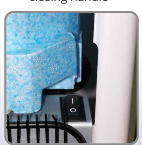
Hot water ON and OFF switch