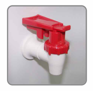
PP Faucet with self closing handle