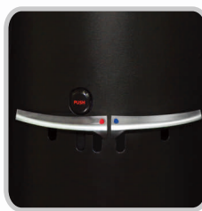
Sturdy Metal Faucet Handles