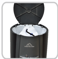
Point of Use Dispenser

Inspired by the award winning Everest model, Crystal Mountain introduces the stunning Everest Elite. Innovative design features include: removable side panels, double mechanical float, and raised faucet handles. Its sleek design and upscale look is perfect for either home or office environments. Crystal Mountain proves that anything is possible when there is a drive to reach new heights!