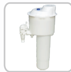
Removable Reservoir/Faucet Assembly (patent pending)