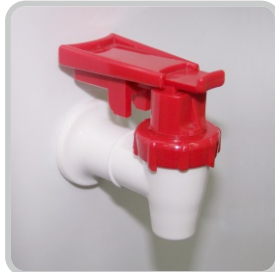
PP Faucet with self closing handle