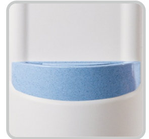
Removable drip tray