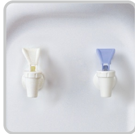
Cook & Cold water Faucet