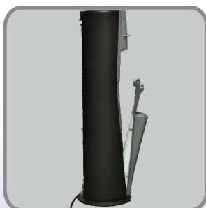
Replaceable Lower Front Panel with Optional Integrated Cup Dispenser