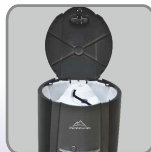
Retrofitted to Become a Point of Use Dispenser