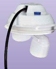
Point of Use Kit