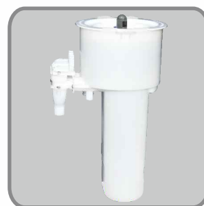
Removable Reservoir/Faucet Assembly (patent pending)